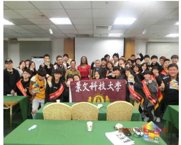
2020/1/16 客委會李永得主委與柏安卓大使等出席簽署 60 國論壇「合作備忘錄」(左上照片) 客委會已派兩名學生出席論壇，南華大學掛名參與辦理 60 國論壇 柏大使並與出席簽署典禮的景文科大學生合影(右上照片)